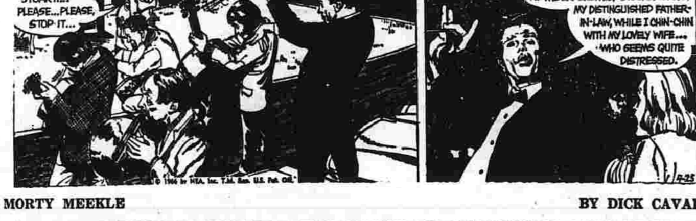
YOU'RE THINKING OF GOING INTO POLITICS